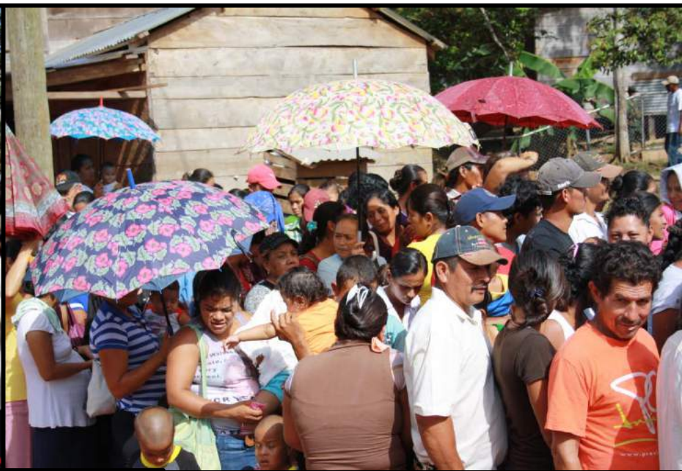
Opening Day Queues